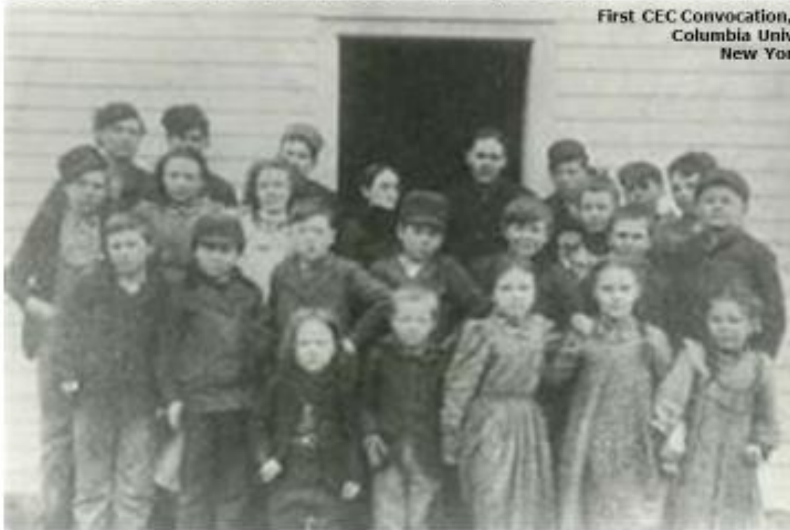
First CEC Convocation, 1923 Columbia University New York City